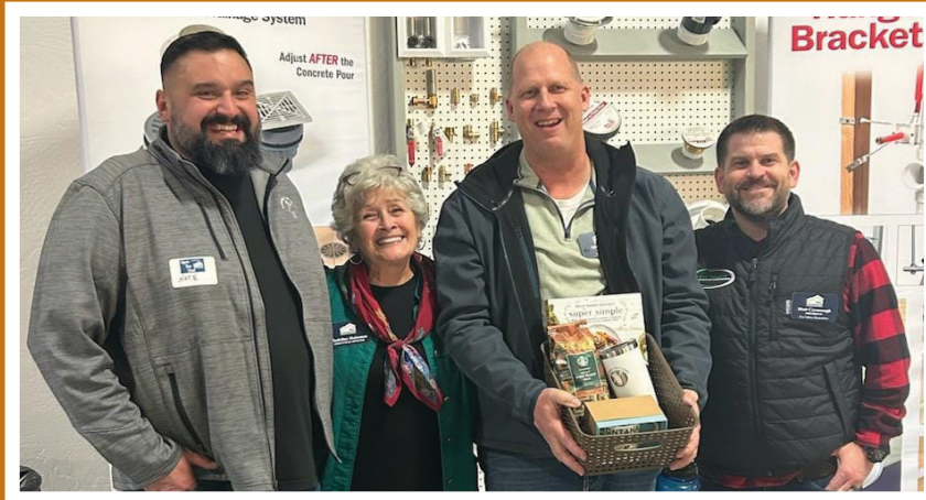
Door prize winner at Open the Door at Northwest Pipe