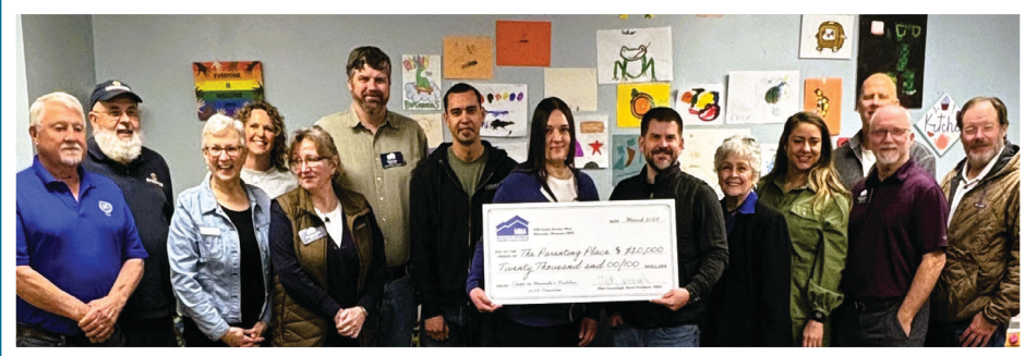
Members of Parenting Place and MBIA gathered around the check presented by Missoula's Builders to the Parenting Place for repairs to their buildings.